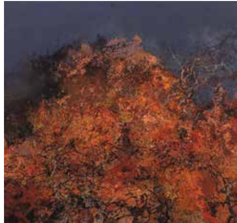
A Peak of Reds , 2014. © Hong Ling. Courtesy Soka Art Beijing

As the first exhibition of Hong Ling's work in Ireland, this retrospective highlights Hong Ling's vibrant contribution to the world of Chinese landscape painting through a selection of works in both oils and ink drawn primarily from private collections.