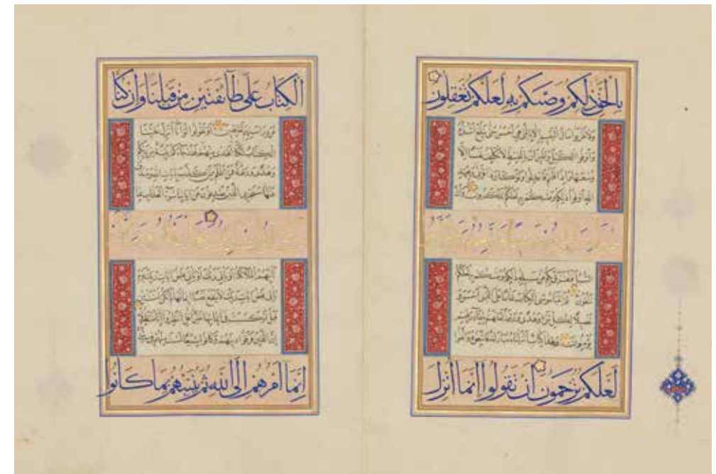
Left: The Ruzbihan Qur'an c. 1550, Shiraz, Iran CBL Is 1558, f. 442b