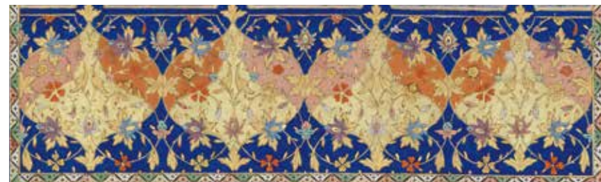
The Ruzbihan Qur'an, c. 1550, Shiraz, Iran. CBL Is 1558, f. 208b (detail)