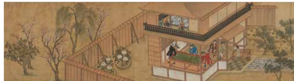
Detail from Painting of the Dutch Mansions in Dejima , Nagasaki. 18th century. Edo period, Japan. CBL J 1131

Following an extensive programme of conservation, the Painting of the Dutch Mansions in Dejima is now on display in the 'Arts of the Book' exhibition. This eighteenth-century painting shows Dutch traders living on the artificial island of Dejima in western Japan.