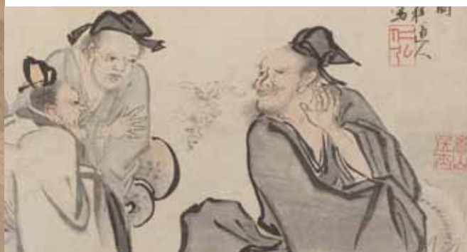
Guo Xu, 'Immortal Ge spitting fire', Album of Various Subjects .

Telling Images of China coincides with the run-up to the World Expo in Shanghai (May–October 2010) and is accompanied by an illustrated catalogue, generously supported by the E Rhodes and Leona B Carpenter Foundation, an international scholarly conference (30 April–1 May), and a programme of public events. See calendar overleaf or visit our website at www.cbl.ie .